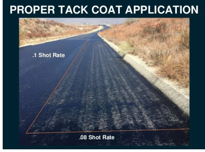
Poor Tack Coat VS Good Tack Coat